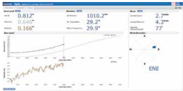
Figure 5. Predicted vs actual sea level at the Apia tide gauge Samoa, 3 May 2018.

The Pacific Sea Level and Geodetic Monitoring Project provides sea level and meteorological information for 13 countries and tide predictions for 20 locations in the Pacific region. It is an important resource for those involved in disaster mitigation and adaptation planning, coastal development, and the shipping, fishing and tourism industries.