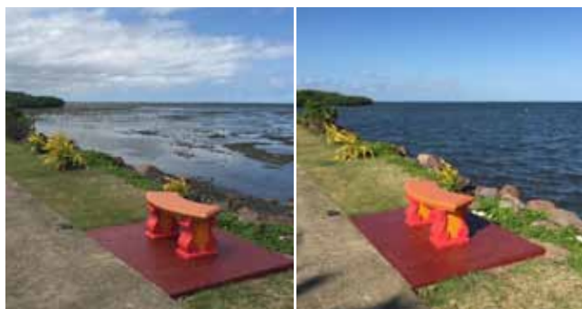
Figure 1. Low and high tide in Suva, Fiji.

Tides are the daily rise and fall of sea levels, caused mainly by the gravitational pull of the moon as it revolves around the earth. Tides are also affected by the earth's rotation and the gravitational pull of the sun.