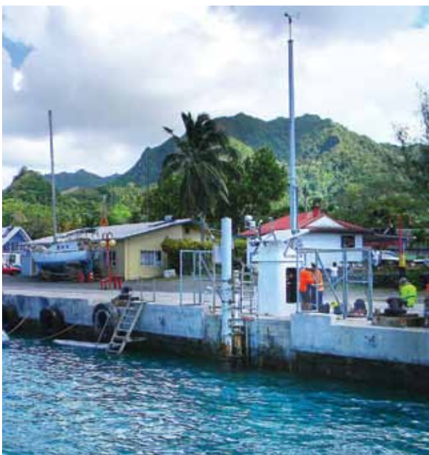
Figure 4. Technicians working on the recently-refurbished Cook Islands tide gauge, which has been monitoring sea level and weather conditions in Rarotonga for over 25 years.

These observations tell a story about the sea levels at these locations, such as: How high was the highest tide in Apia? What effect does El Niño have on sea levels in Kiribati? All of this information is also used to verify and improve tide predictions.