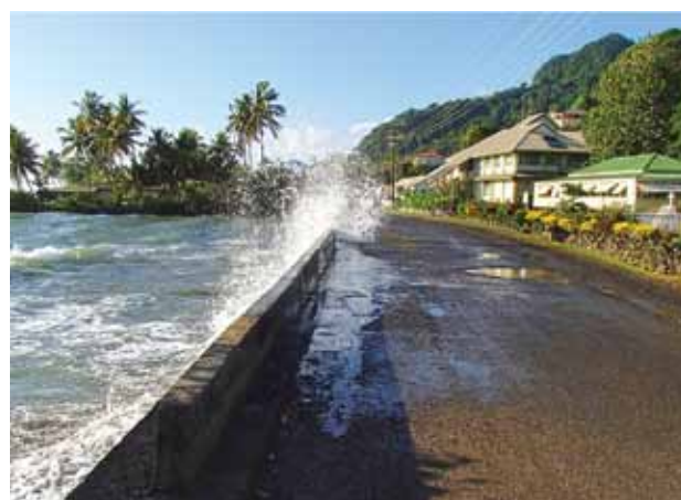
Figure 3. Strong southeasterly winds and currents combine to create higher than normal tides in Levuka, Fiji.

It is also important to know that king tides have always occurred and are not a result of sea level rise.